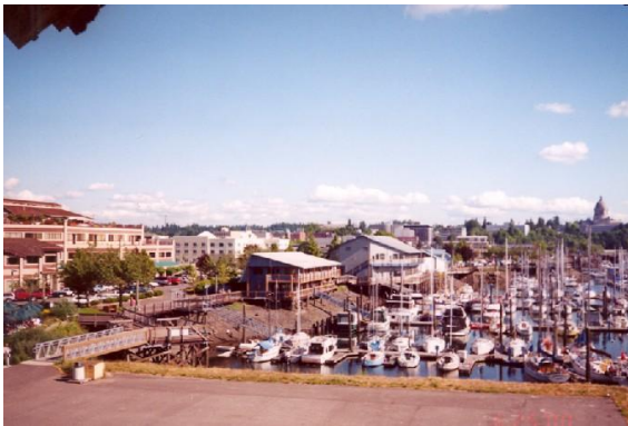
Boats crowd the capital city's harbor

Four blocks west is CAPITOL LAKE PARK , offering a wide range of recreation and the location of Capitol Lakefair , a community festival held in early July. The lake's fringe of Japanese cherry trees flowers in April. The Fifth Avenue Bridge spanning the lake's outlet, offers a vantage point for watching migrating salmon from August into October.