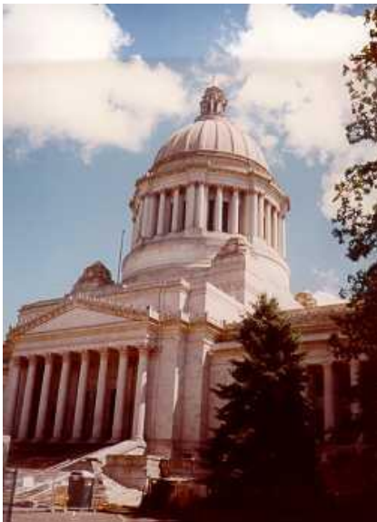
Washington's Legislative Building

A stroll around the campus reveals imposing monuments such as the striking Winged Victory (a World War I memorial), Tivoli Fountain and memorials to World War II, the Vietnam War and the Korean War. A 71-foot Story Pole totem, dedicated in 1940, stands nearby. In spring Japanese cherry trees and massive banks of rhododendron add color to the campus. From the north side of the campus, adjacent to the Greenhouse, a fine view extends across the city to Budd Inlet and the distant Olympic Mountains.