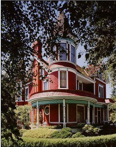
The Old Consulate Inn is an AAA 3-diamond bed and breakfast.

Follow Washington Street, which leads up the bluff, parallel to Water Street. At Harrison and Washington stands the 3-story Customs House (1893), presently a post office. Sculpted faces of s'Kllam Chief Chetzamoka and his wives and brother cap the columns guarding the south entrance. Its lobby features historical photographs.