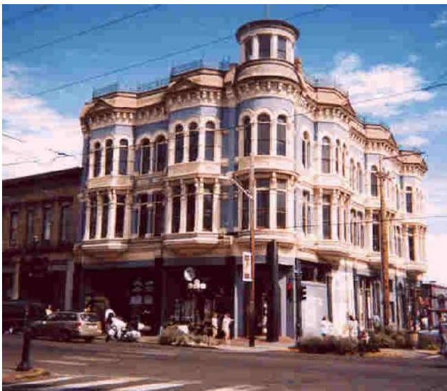
The Hastings Building (1889) at Water and Taylor streets in the heart of old Port Townsend.

The district has numerous noteworthy structures. Walking west along Water Street from Madison, look for the Franklin House , built in 1886, this was the first brick “fireproof” hotel in the city. It stands on the site of an earlier hostelry dating back to 1869. Continuing west on Water Street, you’ll see the Waterman & Katz Building (1885), formerly a ship’s chandlery. The handsome cast iron façade of the C.F. Clapp Building (1885) is across the street. It originally housed a bank. The nearby C.C. Bartlett Building was built in 1881.