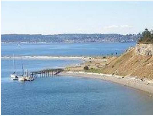
Fort Flagler State Park occupies the northern end of Marrowstone Island. Port Townsend lies in the background across its namesake bay.

The Army erected a coastal defense installation here in the late 1890s, complete with camouflaged concrete ramparts and rifled cannons mounted on disappearing carriages.