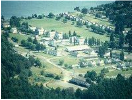
Fort Worden State Park features many historic buildings.

A row of stately white frame homes faces the parade grounds at the southern end of the park. These formerly housed the post's officers and their families. Some are available for overnight rental. The nearby rhododendron garden contains more than 1,000 plants.