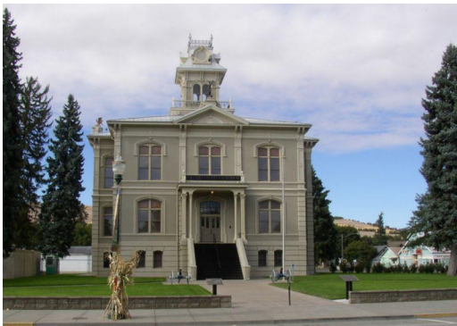
The Columbia County Courthouse is the state's oldest still in use.

East of Waitsburg, US-12 follows the Touchet River, closely flanked by grassy hills. Five miles east is Lewis and Clark Trail State Park ( www.parks.wa.gov/parkpage.asp?selectedpark=Lewis%20%26%20Clark%20Trail ) is a 37-acre site with a quarter-mile of Touchet River shoreline. The Corps of Discovery passed through here in May, 1806 on the eastbound leg of their epic trek. They remarked on the riparian woodland of ponderosa pine and black cottonwood, refreshing in the otherwise semi-arid landscape. The park has interpretive markers, picnic tables and a small campground. Open daily (fee for camping).