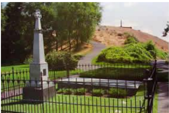
The Great Grave contains the remains of the Whitmans and others killed in 1847.