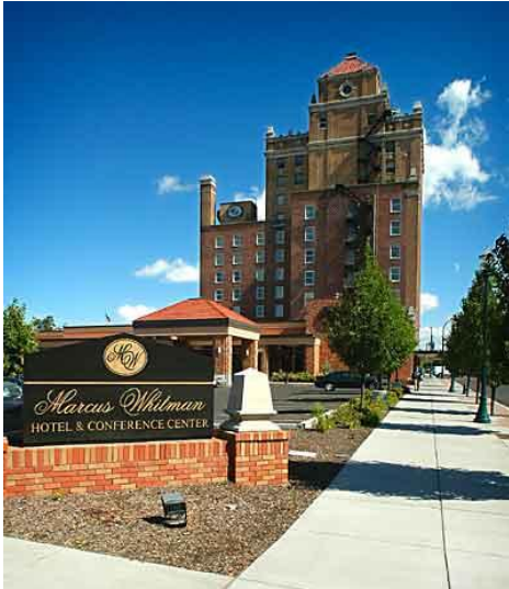
The beautifully restored Marcus Whitman Hotel