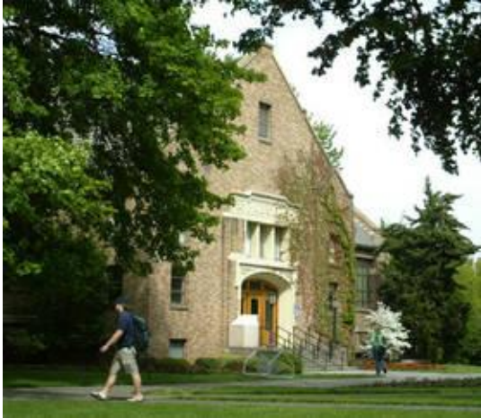
The 1944 Peterson Memorial Library, on the campus of Walla Walla College.

COLLEGE PLACE (pop. 8,770, alt. 935 ft.) is a separate city adjoining Walla Walla on the west. The town grew up around and took its name from a college established by the Seventh Day Adventist Church in 1892. WALLA WALLA COLLEGE ( www.wwc.edu/about-wwc ) occupies a tree-shaded campus on N. College Street.