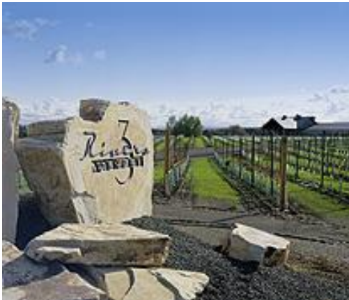
Three Rivers Winery

The federal government designated the Walla Walla Valley American Viticultural Area (AVA) in 1984. AVA's, or appellations, are wine growing regions recognized for the specific characteristics the local geography imparts to the vintages produced from grapes grown in that district. Appellation designations on bottle labels identify the origin of the grapes used to craft the wine.