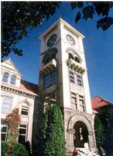
Whitman Memorial Building is a city and campus landmark.

Boyer Avenue bisects the campus from west to east. College Creek meanders across the campus. Its ponds provide habitat for ducks. Cordiner Hall , at Boyer and Park Street, contains a 1,400-seat auditorium, venue for baccalaureate ceremonies, speeches and concerts, including the Walla Walla Symphony. The 1889 Whitman Memorial Building (the “Mem”) the oldest building on campus. Its clocktower is a local landmark. Spanish House, Japanese House, Fine Arts House and others, are special focus student residences. The elegant, 1921 Penrose Hall , at Boyer and Stanton Street, houses the Offices of Admissions and Financial Aid. It was the residence of Whitman’s president until 1995. This is the starting point for campus tours.