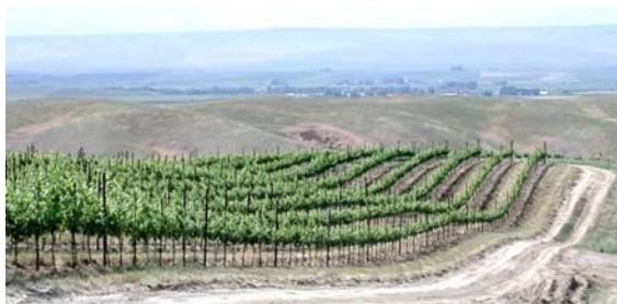
The estate Woodward Canyon estate vineyard near Lowden

Estate wineries feature the production facility on the property where their grapes are grown. Some wineries are located on a site distant from the vineyards. A new trend is urban tasting rooms. In some cases these sites feature several different wineries.