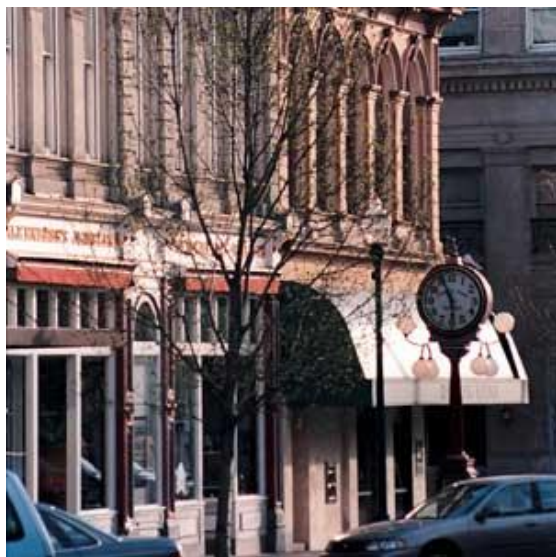
Historic brick facades line Walla Walla’s Main Street

Walla Walla is a Cayuse Indian phrase meaning ‘many waters.’ The bountiful valley’s game had supported Native Americans for thousands of years. The first Europeans to see the area were in Lewis and Clark’s Corps of Discovery, passing through what is today Walla Walla County in 1805 and 1806.