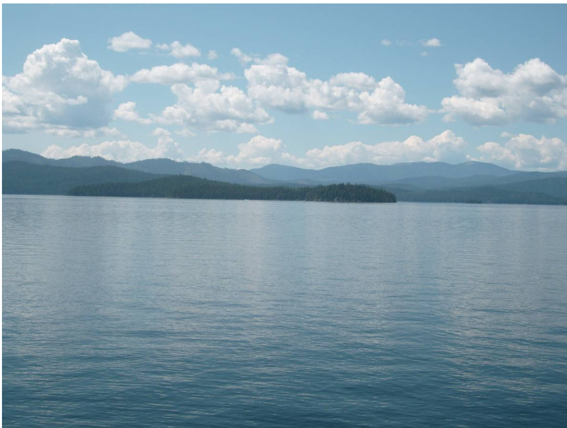
A clear day on Priest Lake, with Bartoo Island in the foreground

Idaho's aquatic jewels, Priest Lake and Lake Pend Oreille are popular day trip and weekend destinations. Whether it's boating, fishing, skiing or mountain biking the Lakes District has all the necessities to be as rustic or luxurious as you like.